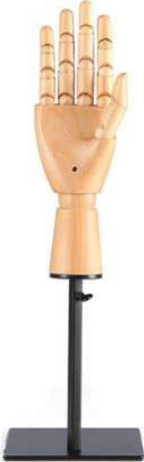
FS-1 HEIGHT: 42CM BASE: 15*13CM