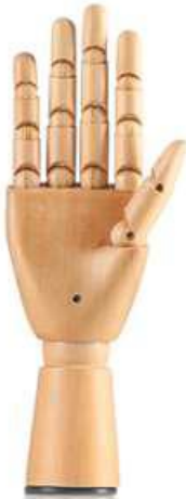
FS HEIGHT: 26CM for hand WRIST: 5CM