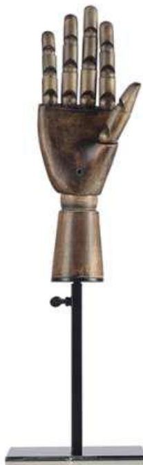
FG-1 HEIGHT: 42CM BASE: 15*13CM