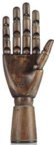
FG HEIGHT: 26CM for hand WRIST: 5CM